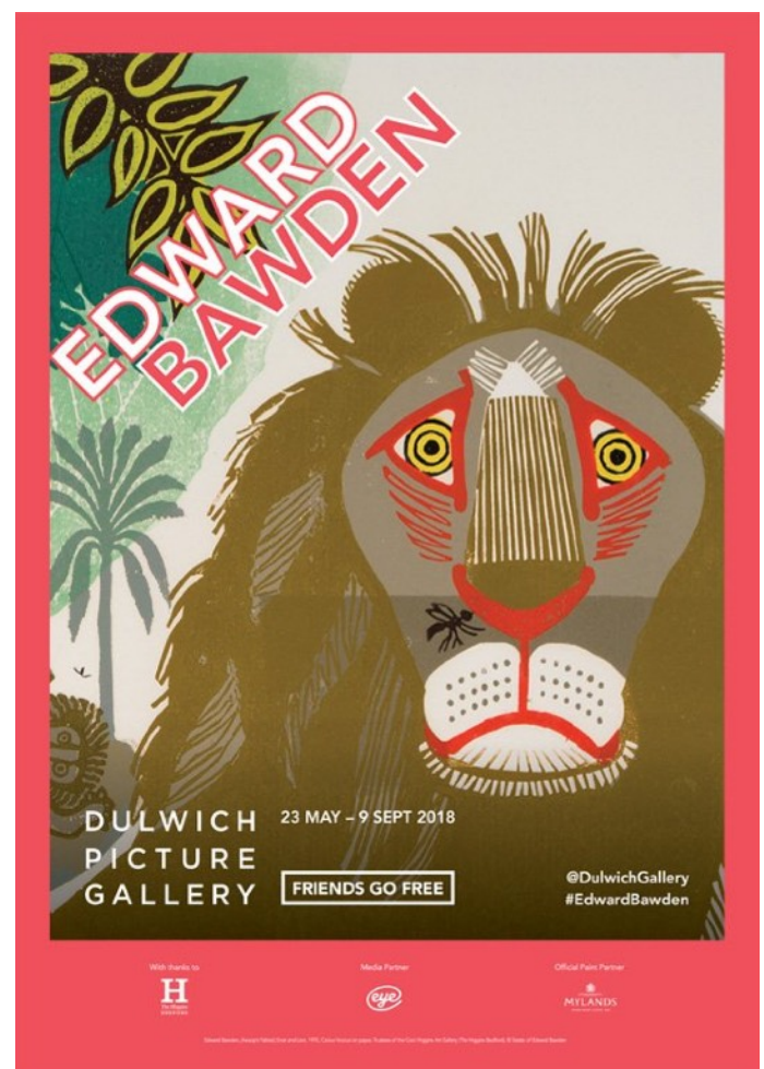
Edward Bawden, Aesop's Fables: Lion and Gnat, 1970 © The Edward Bawden Estate. Courtesy of the Trustees of the Cecil Higgins Art Gallery (The Higgins Bedford). Poster © Dulwich Picture Gallery