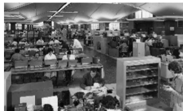
Texas Instruments, c.1957